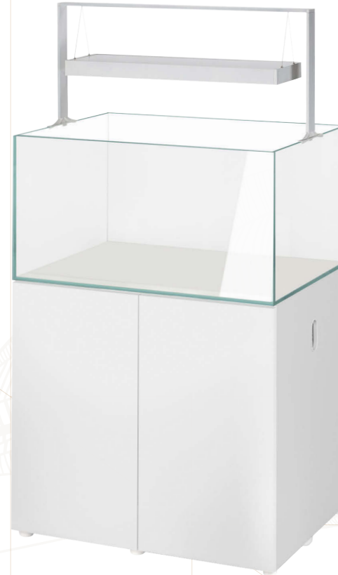
UltraScape 90 Set snow UltraScape 90 Cabinet snow