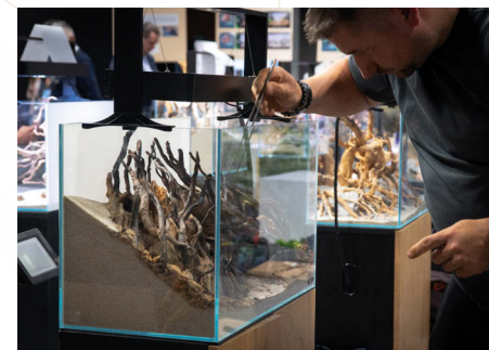
AQUAEL Hardscape Challenge competition during Animals' Days 2021 in Nadarzyn