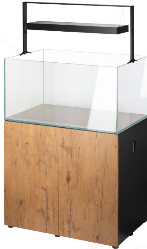
UltraScape 90 Set forest UltraScape 90 Cabinet forest