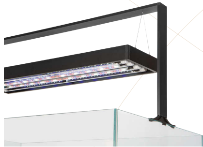
energy-efficient Leddy Tube lighting included