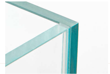
opti type glass