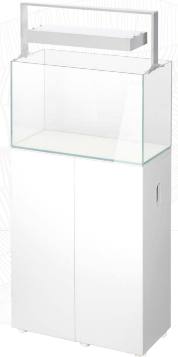
UltraScape 60 Set snow UltraScape 60 Cabinet snow

The ideal tank proportions – the depth of the UltraScape 90 Set and the optimum height of the UltraScape 60 Set , recognised by aquascapers – allow for the creation of unlimited arrangements, following both the experimental and classic trends. Transparent silicone, polished, sanded edges and precise, butt-bonded glass are important finishing features in the premium range of tanks.