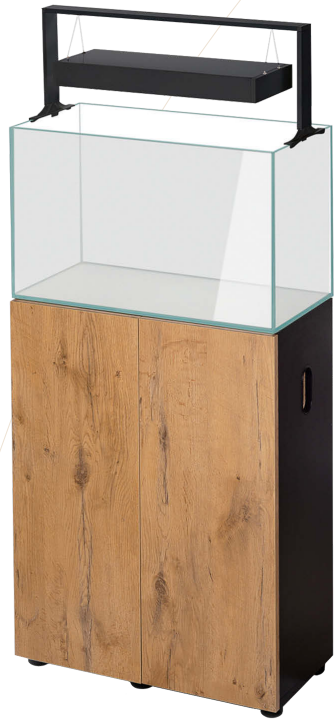
UltraScape 60 Set forest UltraScape 60 Cabinet forest