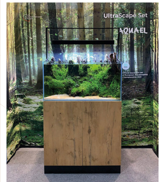
Zoomark exhibition 2021 in Bologna